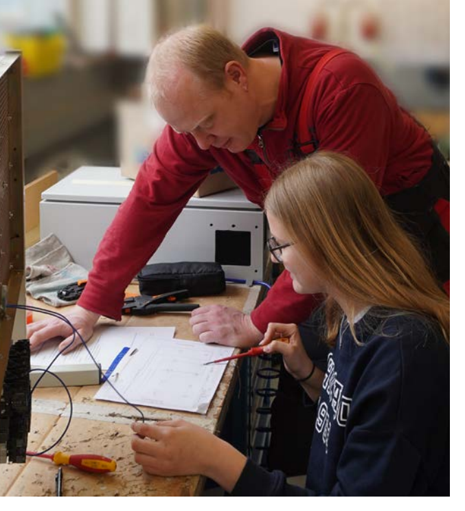
Girl's Day 2024 at B&B

At B&B, we promote equal opportunities for all employees - regardless of gender,